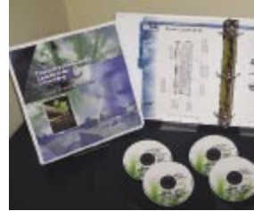
The ACT Training Manual